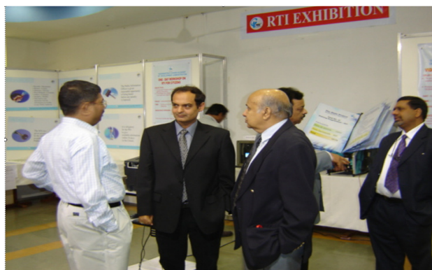
Core Members of NIA and DoPT concerned with the CBAI Project interacting at the 'RTI Exhibition' set up by YASHADA